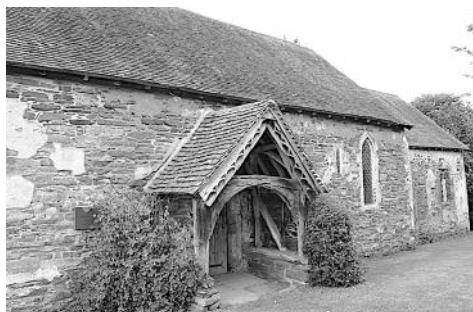
St Bartholomew's Old Church, Lower Sapey

Constant rain, intermittent flooding and treacherously slippery footpaths have curtailed my walking plans this winter. A country ramble in low sun on a bright, crisp day is usually a joy, distant views being enhanced by the lack of leafy foliage, but lately such opportunities have been few and far between. On a slightly less damp day than most, I ventured out on a circular walk which started at Leysters church and ended with an excellent all-day breakfast at The Fountain Inn. The route took in some quiet lanes and passed another church along the way. I couldn't resist a quick look inside and was rewarded with a copy of a free magazine