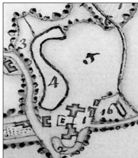
Kyre Park in 1773 by Nathaniel Kent. 4 is the river, shorter than now. Also note no lakes in the valley running top to bottom at the right, they came later.

Secondly, who designed the garden in 1760?